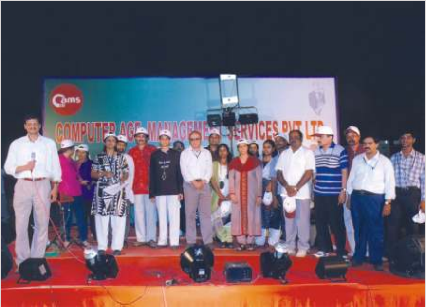
CAMS Family Day, 2006