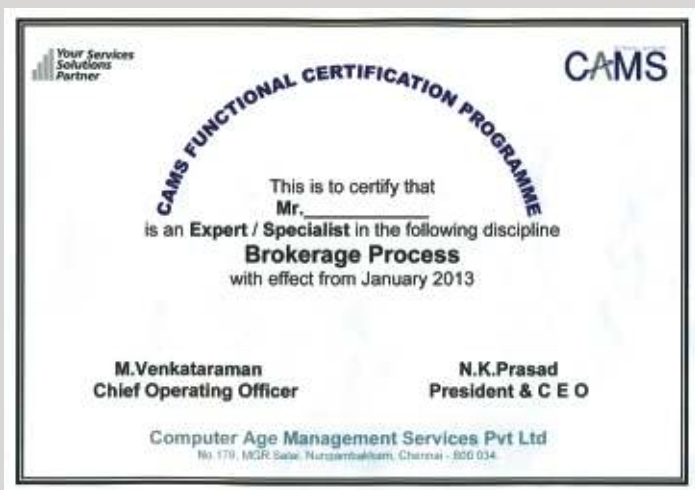
The CFCP certificate issued to skilled employees