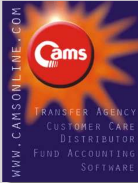
The first logo of CAMS