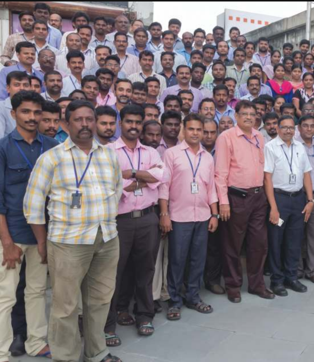
The CAMS team at Rayala Towers