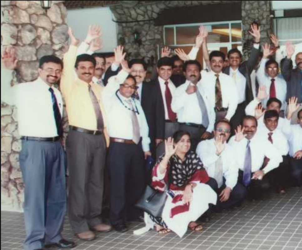
At a CAMS offsite in Singapore, 2008