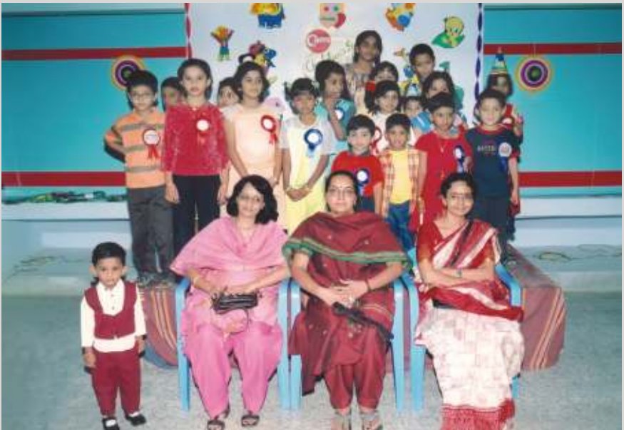
Children's Day, 2006